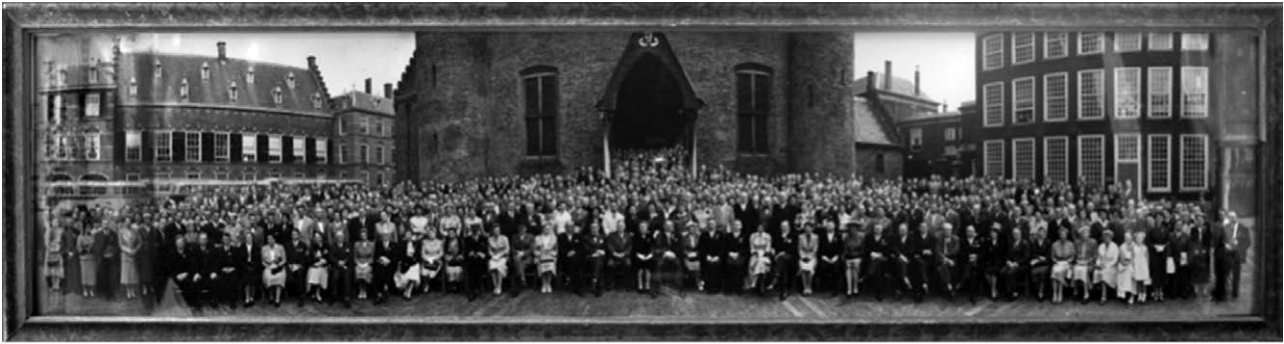
Figure 2. Attendees of the First World Congress of the WFSA in Scheveningen, Netherlands.